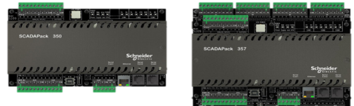
SCADAPack Modbus-centric Smart RTUs