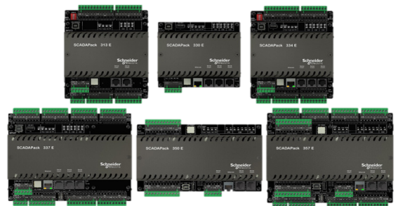
SCADAPack DNP3-centric Smart RTUs